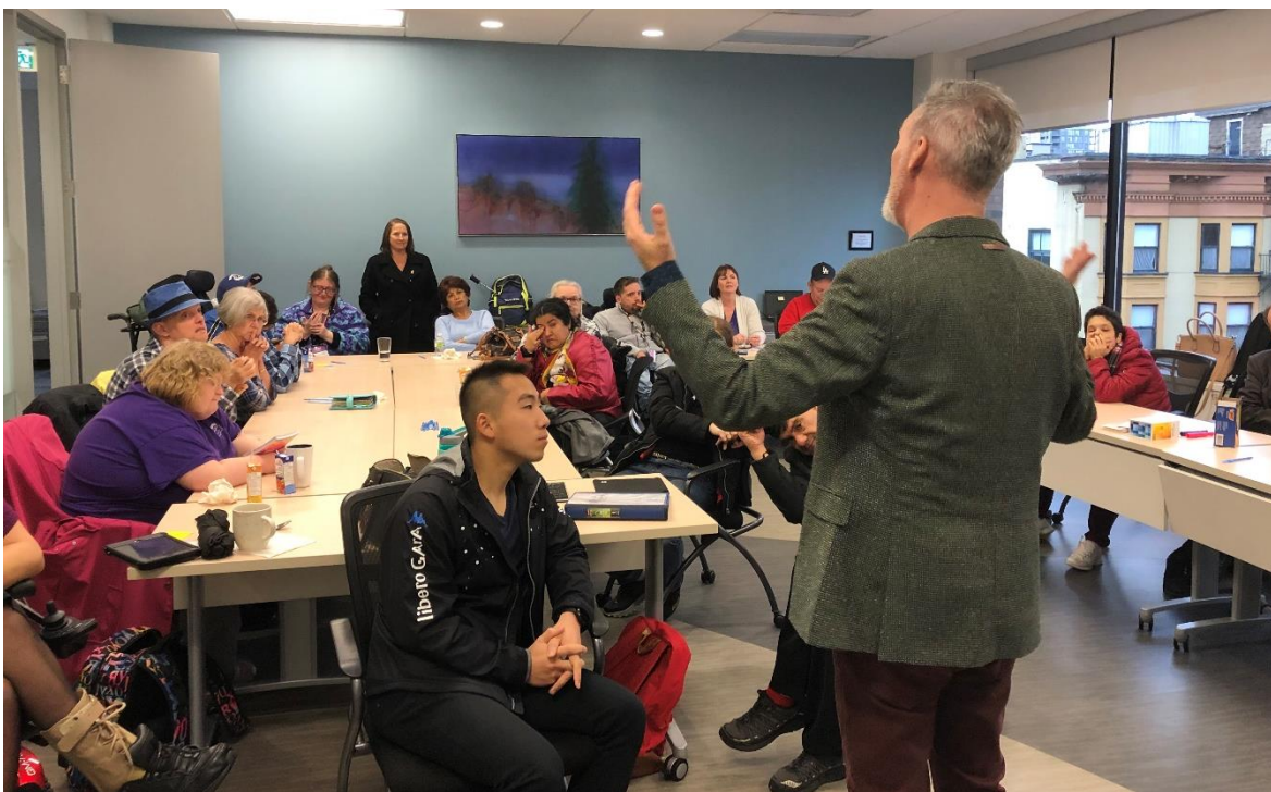
Vancouver Foundation Application Consultation

Through social theatre we will problematize and transform societal misperceptions and stereotypes by celebrating self-advocates' abilities and right to work. This project will tackle this complex social issue and challenge employers to learn about the benefits of inclusive hiring. Moreover, this project aims to increase awareness about the rights to employment for self-advocates among family members, support workers, employers, and individuals with IDD themselves. Self-advocates deserve to work! This project is building on the success of the Romance, Relationships and Right Participatory Theatre project.