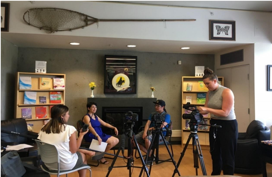
TYDE PROJECT VIDEO PRODUCTION