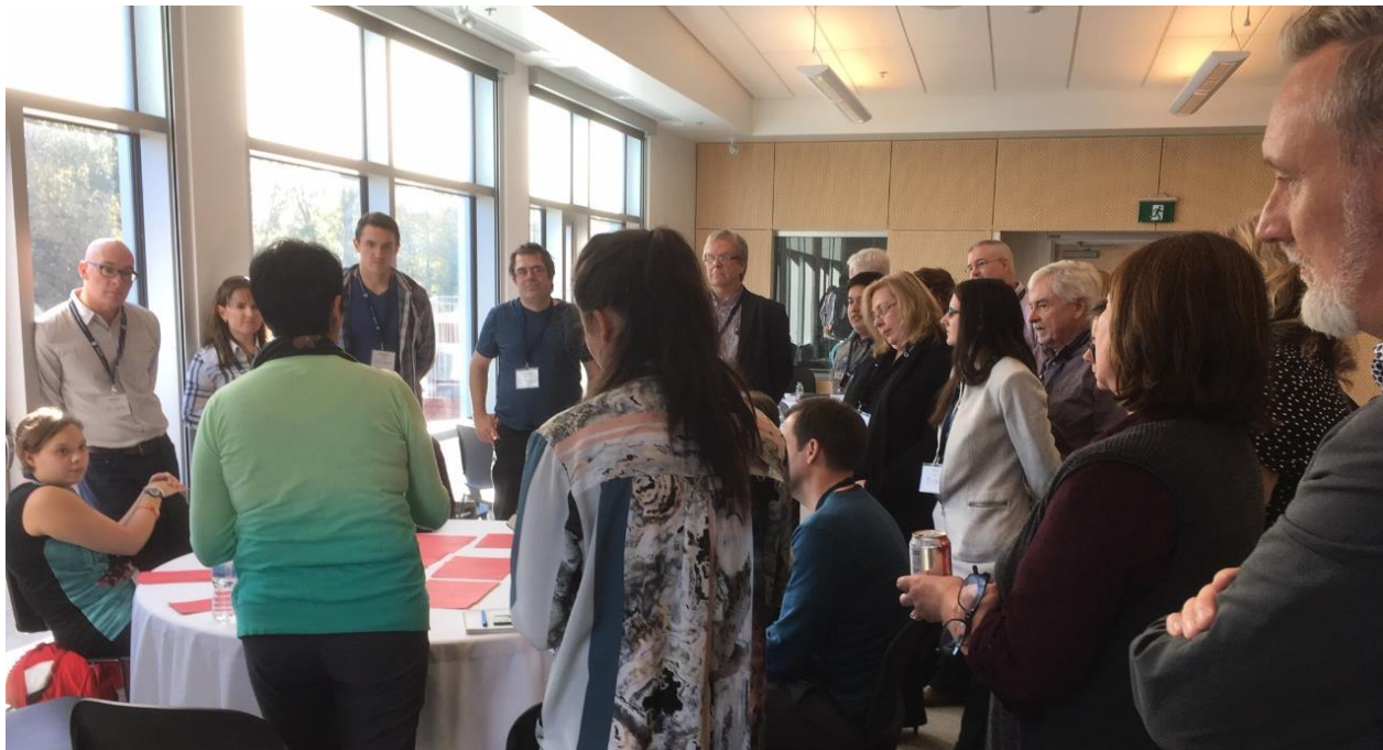
TYDE PROJECT PARTNER CONSULTATION

This project is an interdisciplinary, cross-sectoral network of partners committed to improving the employment outcomes for transitioning youth ages 14 – 18 with intellectual disabilities or autism in British Columbia through early an intervention targeting youth and their parents/caregivers. Through this partnership, we are creating an interactive online curriculum to increase employment outcomes for youth with developmental disabilities by increasing youth pre-employment skills, increasing youth self-determination, and improving parental/caregiver knowledge and expectations for fostering their youth's future employment experiences.