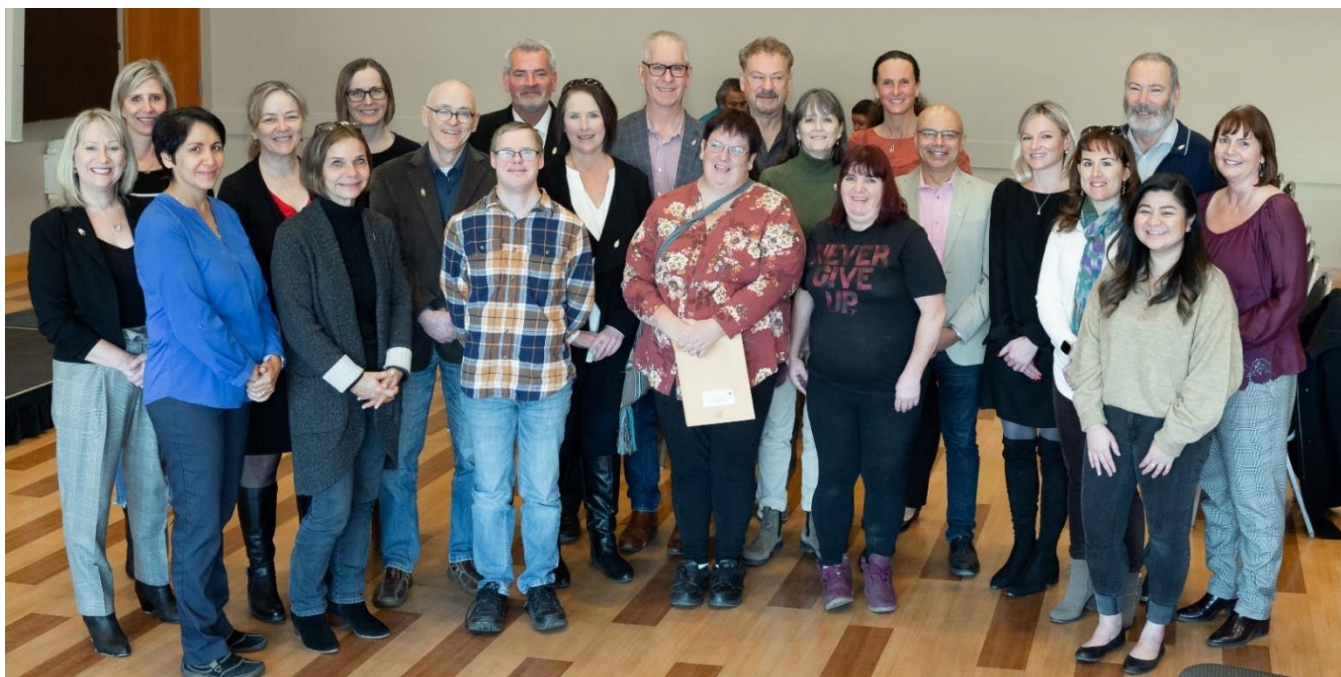
NATIONAL RESEARCH NETWORK INITIATIVE MEETING, UBCO