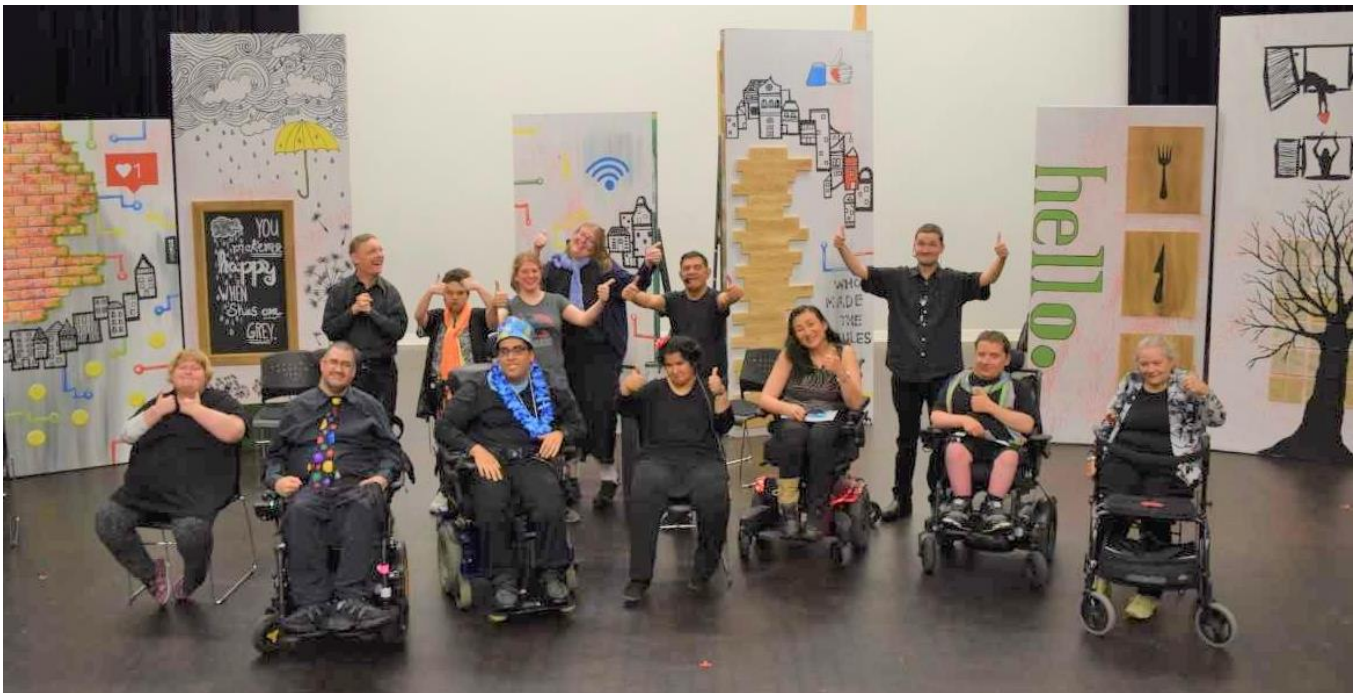
ROMANCE, RELATIONSHIPS & RIGHTS ACTORS/CO-CREATORS