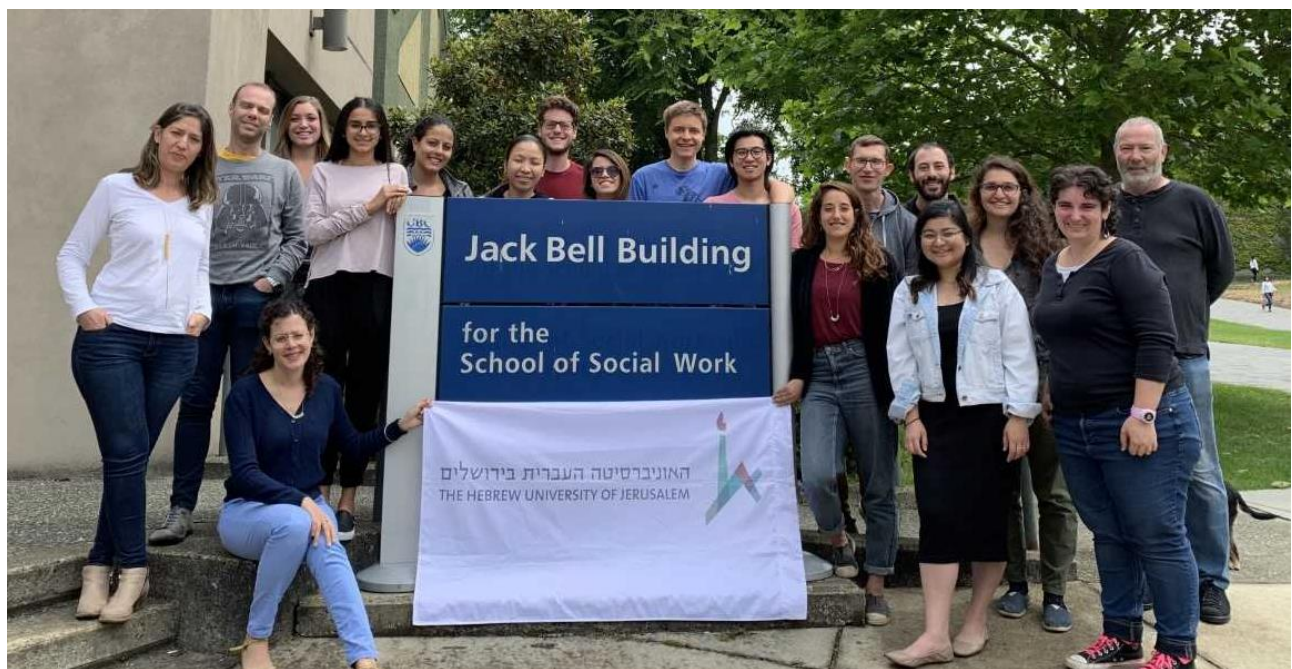
HEBREW UNIVERSITY OF JERUSALEM & UBC SCHOOL OF SOCIAL WORK VANCOUVER