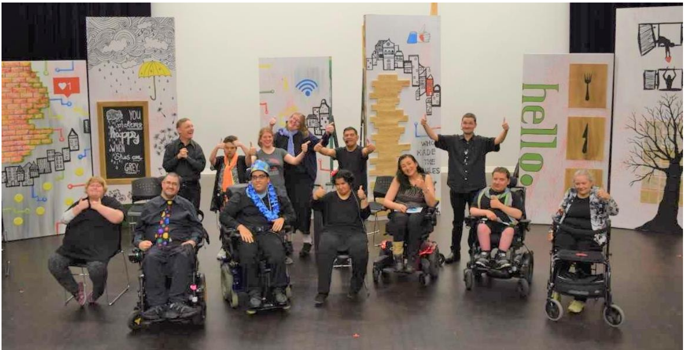
ROMANCE, RELATIONSHIPS & RIGHTS ACTORS/CO-CREATORS